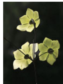
Dogwood in Bloom