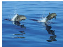
Fraser's Dolphins (1)