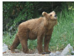
Brown Bear Cub