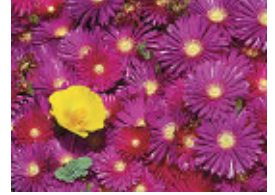
Poppy in Ice Plant