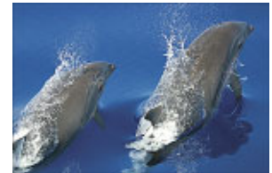
Fraser's Dolphins (2)