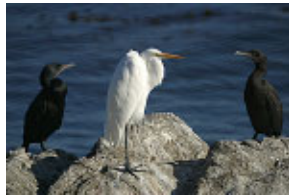
Egret and Cormorants