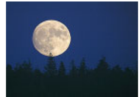
Moonrise over Redwoods