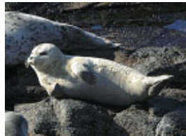
Harbor Seal Pup