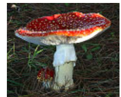
Fly Amanita Mushroom