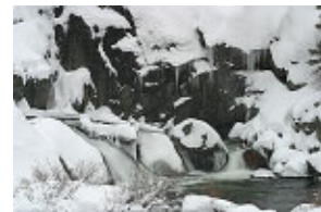
Yuba River in Winter