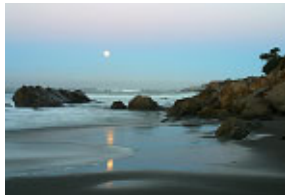
Moonset at Sunrise