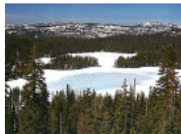
Spring Thaw on Serene Lakes